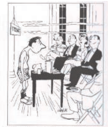
"Although I have not gained much materially..."